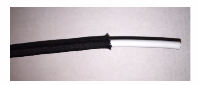
1) Add 8" to Cloth Cord Length & Cut Cord, Slide Outer Cloth Cover back on Cord.