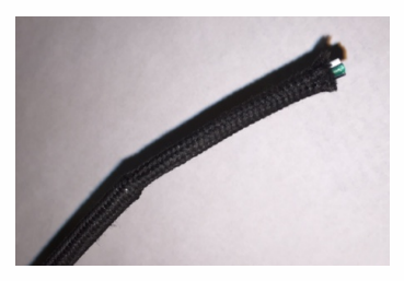
4) Slide Outer cloth cover over wires.